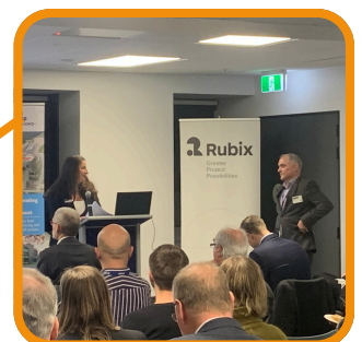
Theme: Building for tomorrow- shaping the future of infrastructure