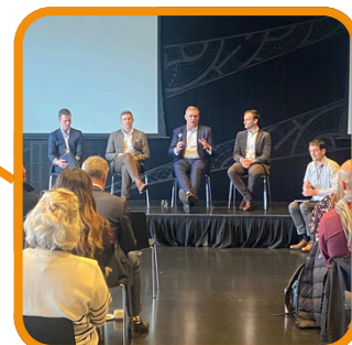
Theme: Does Value Engineering provide us with good value for our money?