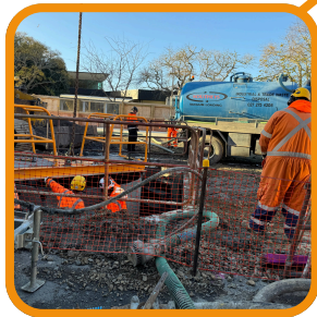
Theme: Site Visit to Eastern Busway Project