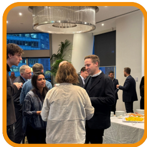
Theme: Private Public Partnerships 2.0 and Alternative Funding Mechanisms for Funding Auckland Infrastructure